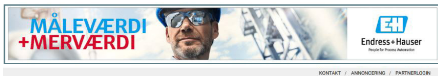
TOP BANNER 1140 x 140 px